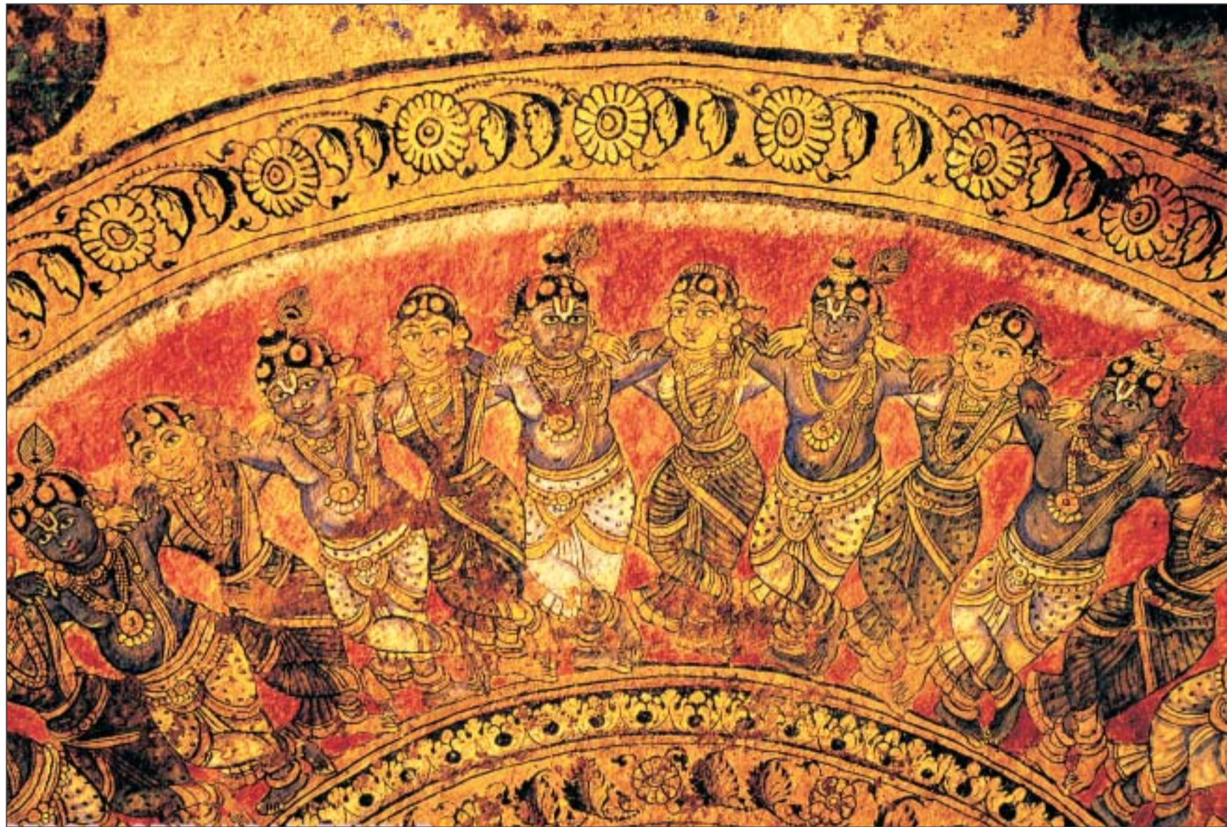
In an ancient land, the old traditions have blended with new technology in a seamless synergy to make life better for everyone

This is a paperless File Management System implemented at ELCOT as an empowerment tool for speedy disposal of files. The workflow management helps in creation, movement, monitoring and approval of files electronically resulting in better utilization of manpower, thereby avoiding delays, leading to better governance. As the system is web-enabled, it facilitates operating anywhere at any time.